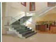
Handrail & Baluster Systems